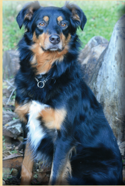
Black & Tan with Minor White