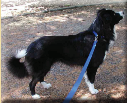
Black and White

English Shepherds come in four main colors: Sable & White (sable may have black shading, varying from none at all to very dark), Black & White, Black & Tan (some have a white spot on the chest), & Tri-Color (black, white & tan) Notice different ear & tail set.