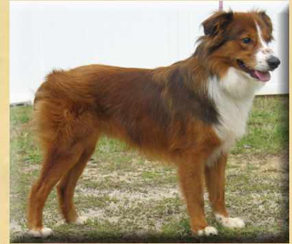
Sable & White with Natural Bob Tail