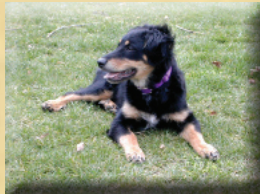
Black & Tan Puppy