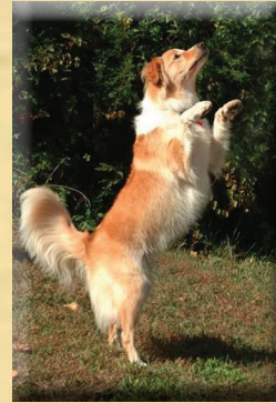
Clear Sable & White